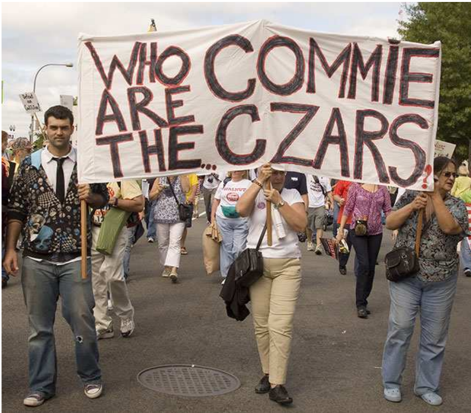
Who are the commie czars?