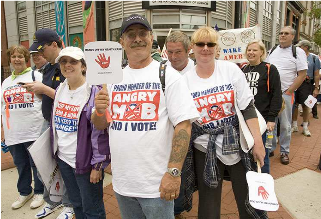
Proud members of the "Angry Mob" and they're armed with their votes.

like radical left-wing ACORN. Different DNA!