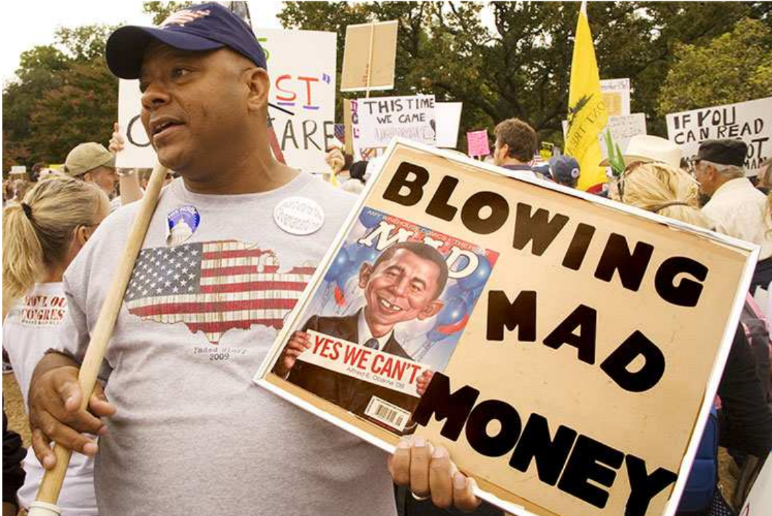
Protesters came from every state in the union. This man came from San Antonio, TX. He said that he was really sorry he hadn't brought his family. He stated that being a black conservative he was afraid to expose his children to what he expected would be a lot of liberal abuse. He was thrilled with the tenor of the event and the fact that no