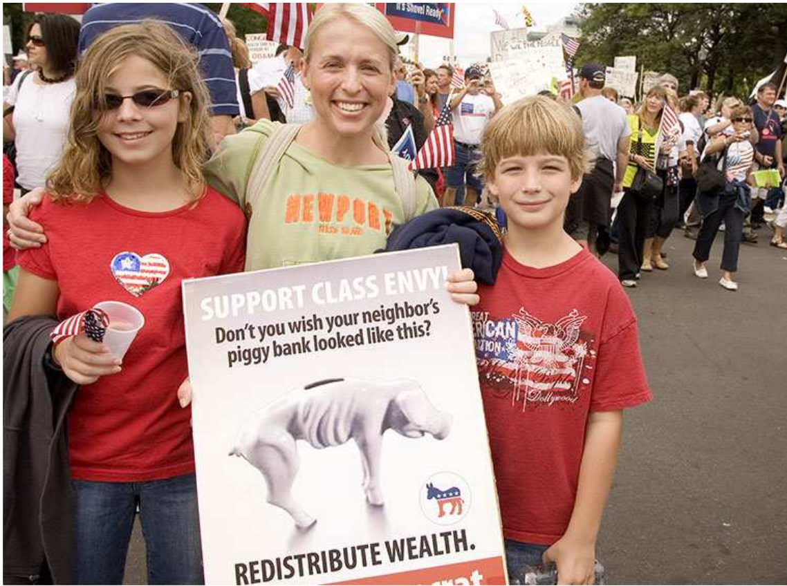
Support Class Envy! Redistribute Wealth.