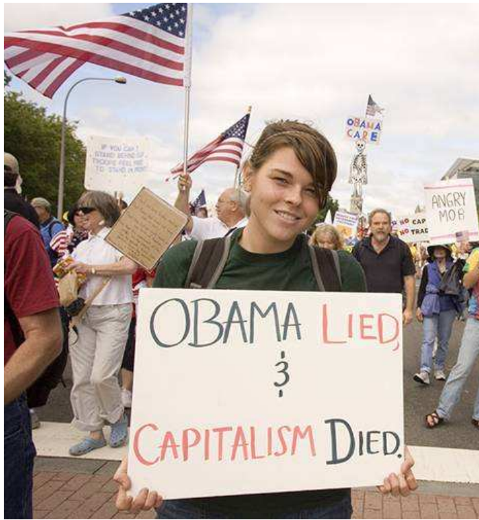
Obama Lied, Capitalism Died.