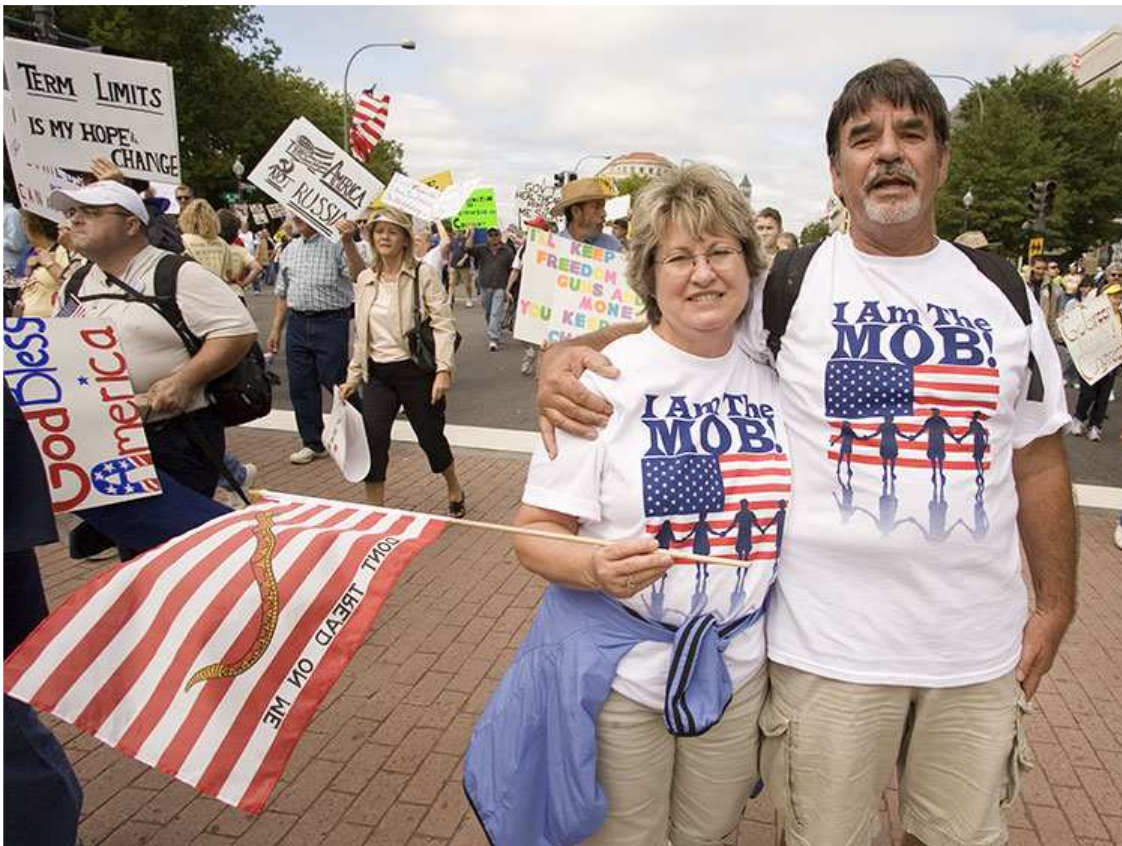
We are the mob!