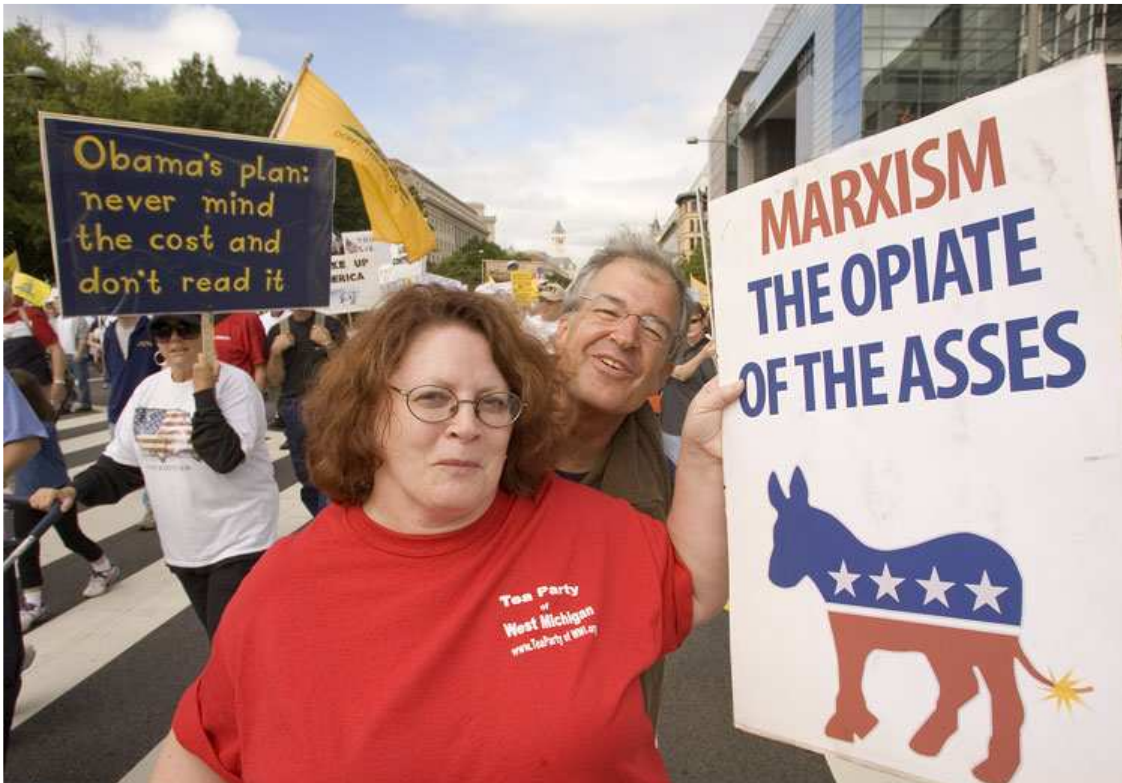
Marxism – the opiate of the asses – Posters from the Peoples Cube are proliferating amongst protesters.