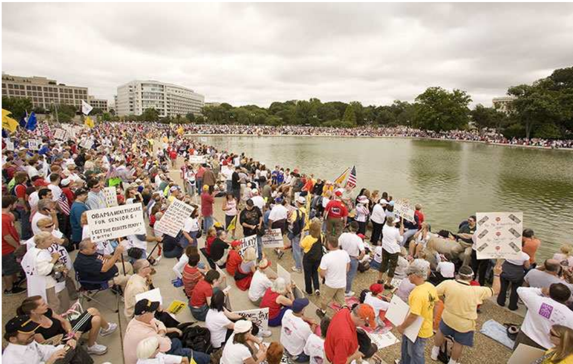
The two photos above show a tiny fraction of the two million ABC estimates attended. I saw signs and heard lots of comments comparing this event to Woodstock. At the time this photo was taken, around 1:00 p.m., Pennsylvania Avenue was still jammed completely, and the mall was packed from the Capitol Building past the Washington Monument. See aerial photos here .