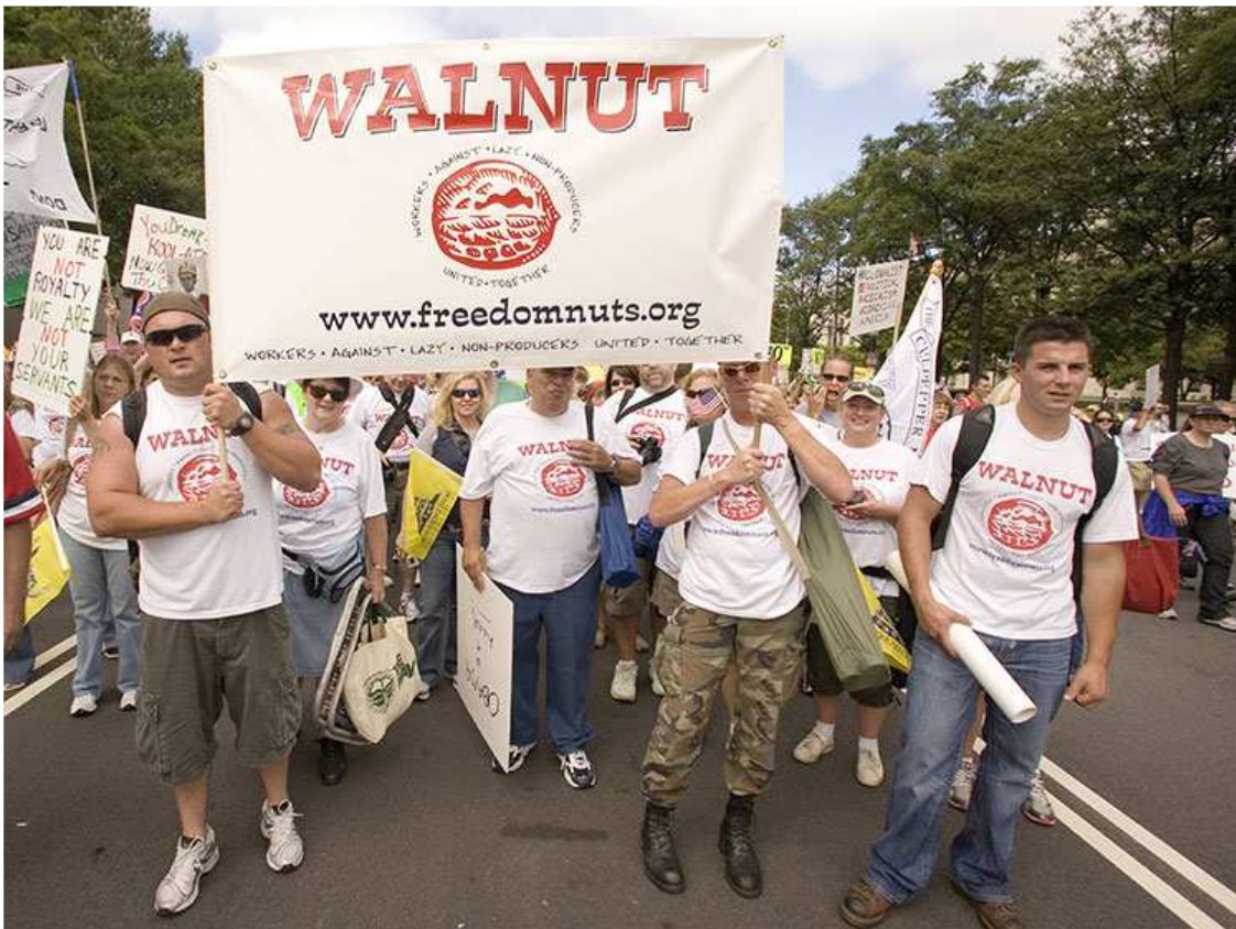
WALNUT – Workers Against Lazy Non-Producers United Together — the conservative answer to ACORN. Didn't have to ask them if they were receiving any taxpayer money