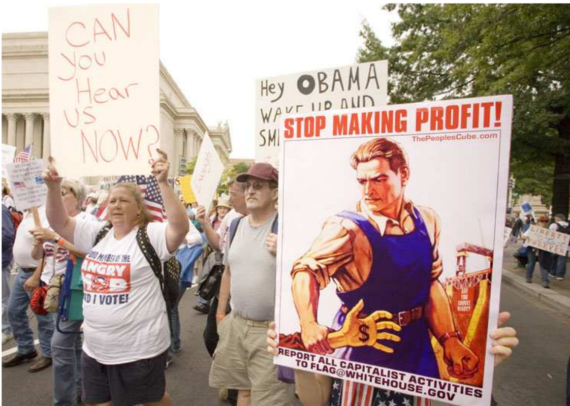
Stop Making Profit! — Report all Capitalist Activities to flag@whitehouse.gov