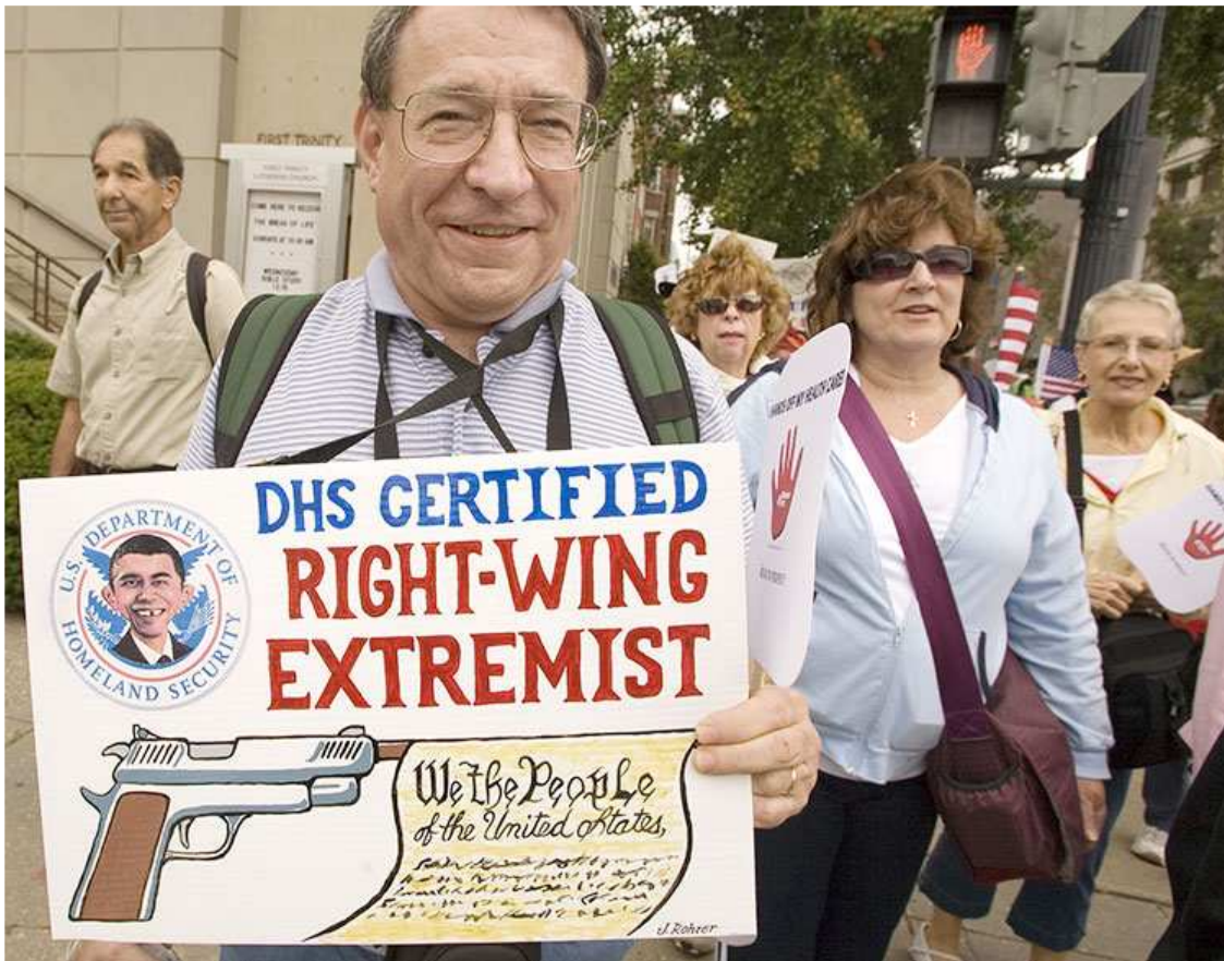
Right-wing extremist armed with the constitution.

Your wallet...the only place Democrats are willing to drill! – Don't share my wealth – share my work ethic!