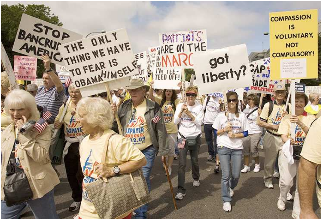
The Only Thing We Have to Fear is Obama Himself - - - Compassion is Voluntary, Not Compulsory!